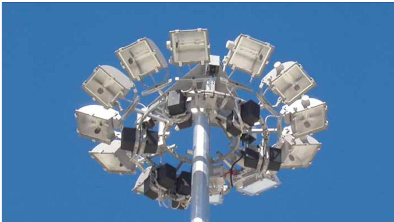
LIGHTING MASTS WITH MOBILE CROWN FOR EXPLOSION PROOF FLOODLIGHTS EEX D IIB T3 IP65

Installation: hazardous areas - Zone 1/2 (Gases) - Zone 21/22 (Dusts) - Safe Area